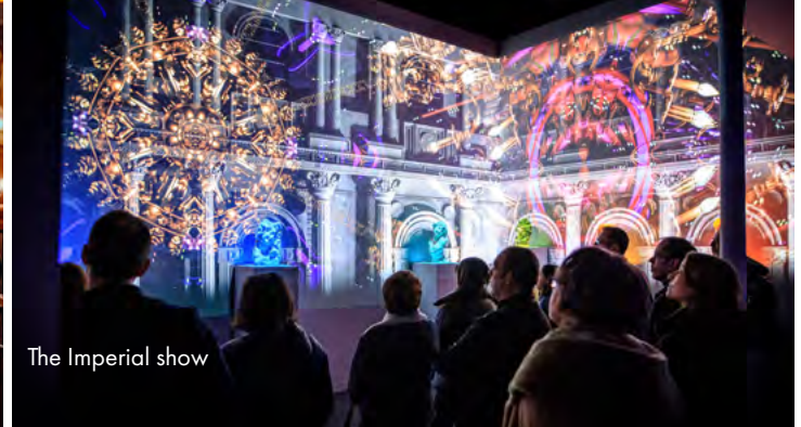
The Imperial show