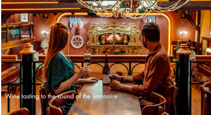
Wine tasting to the sound of the limonaire